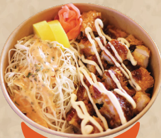
Terri Mayo Katsu 테리 마요 카츠 컵밥