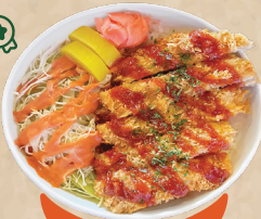
Sweet Chili Katsu 스윗 칠리 카츠 컵밥