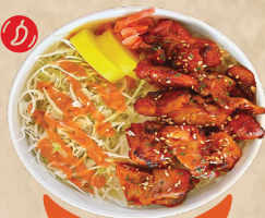
Buldak Oven Chicken 불닭 오븐 치킨 컵밥