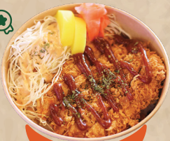
Original Katsu 오리지널 카츠 컵밥