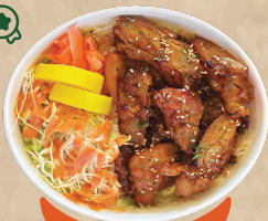
Korean Galbi Oven Chicken 코리안 갈비 오븐 치킨 컵밥