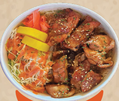
Soy Garlic Oven Chicken 소이 갈릭 오븐 치킨 컵밥