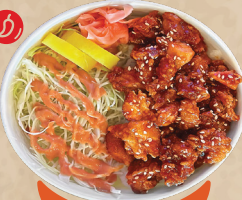
Spicy Korean Chicken 스파이시 코리안 치킨 컵밥 (매운 양념 치킨)