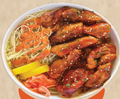
Sweet Chili Oven Chicken 스윗칠리 오븐 치킨 컵밥