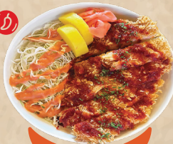
Spicy Katsu 스파이시 카츠 컵밥