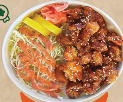
Korean Chicken 코리안 치킨 컵밥 (양념 치킨)