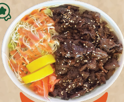
Bulgogi 불고기 컵밥