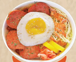
Spam & Fried Egg 스팸&계란후라이 컵밥